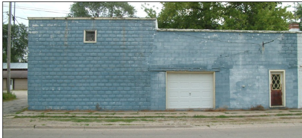
The Clark's Locker Service. 108 E. Railroad St.