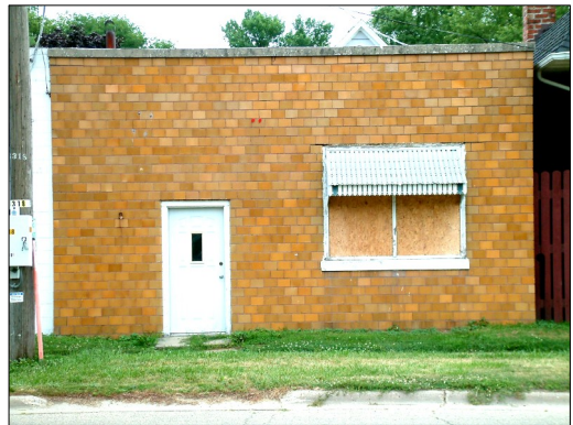
The Whiteside Coop Locker Plant. 116 E. Railroad St.

A couple young fellows in town found a way to enter the locker buildings and steal items out of the lockers, which were just large drawers. Those who rented lockers were given a key for their drawer, but these guys were able to somehow get to the items inside without using the owner's key. Many years later when these boys had grown up one was telling about what he used to do. One of the guys in the group exclaimed: "So that is how our steaks disappeared!" They didn't bother the hot dogs.