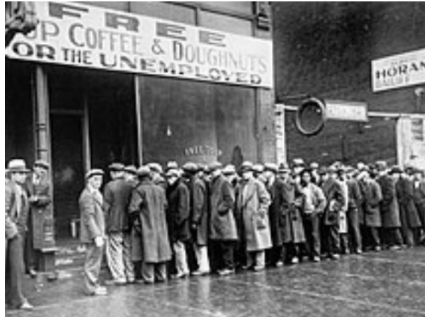
Unemployed people lined up outside a soup kitchen in Chicago during the Great Depression

The Great Depression was a severe global economic downturn from 1929 to 1939 that affected many countries across the world. It became evident after a sharp decline in stock prices in the United States, the largest economy in the world at the time, leading to a period of economic depression. The economic contagion began around September 1929 and led to the Wall Street stock market crash of October (Black Tuesday). This crisis marked the start of a prolonged period of economic hardship characterized by high unemployment rates and widespread business failures.